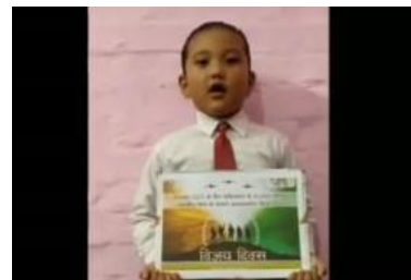
Special Assembly on Vijay Diwas