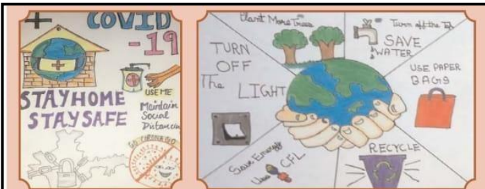
ADITI MISRA, CLASS X, APS, NEHRU ROAD

The District Inspector of Schools, Lucknow urged the students of all the schools on 8 Apr, 2020 to prepare appeal for prevention from Corona every day. Students of APS, Nehru Road have been participating in this activity with great enthusiasm. Every day an appeal regarding corona, which is prepared by the students is sent to the parents as UOLO message. Screenshot of the same is sent to DIOS Office every day. Some of these slogans and posters even found place in Times NIE(Newspaper in Education).