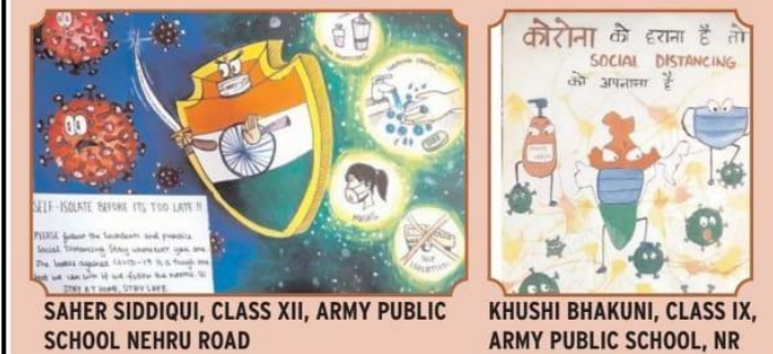
SAHER SIDDIQUI, CLASS XII, ARMY PUBLIC SCHOOL NEHRU ROAD