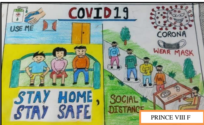
PRINCE VIII F