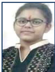
Mansee 97.2% Humanities Stream